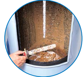
Save on Plumbing Fixtures & Repairs