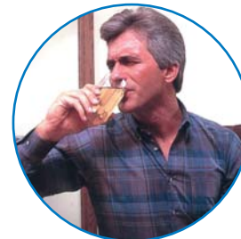
Removes bad taste caused by iron and sulfur