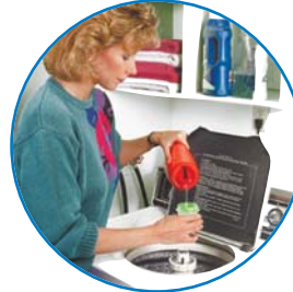
Softer, Fluffier Clothes