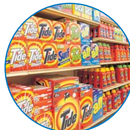
Use Less Soaps and Detergents