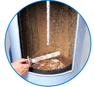
Save on Plumbing Fixtures & Repairs