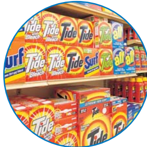
Use Less Soaps and Detergents