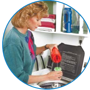
Softer, Fluffier Clothes