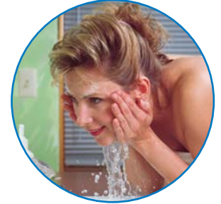
Skin stays naturally smooth; hair silky clean