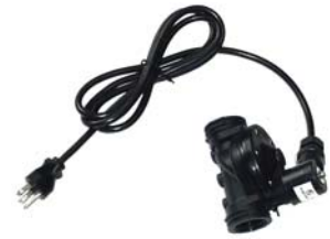
Optional Solenoid Shut-Off Valve