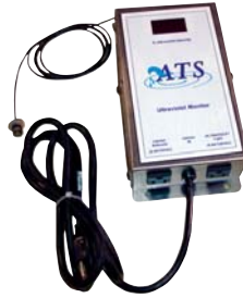
Optional UV Dosage Metering Monitor