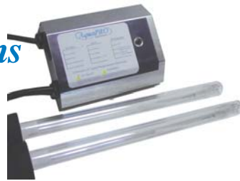
ECONOMY & PROFESSIONAL